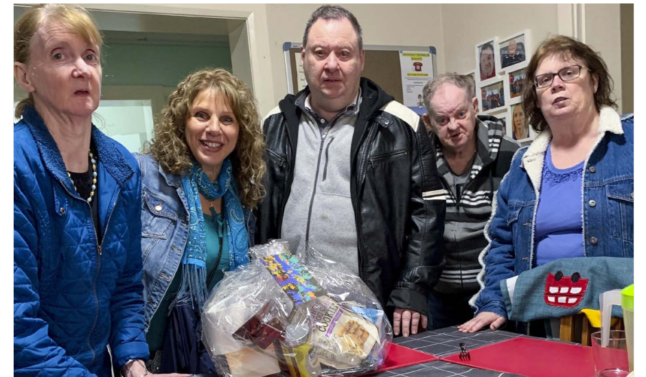
Staff and customers from a home in Westmead.