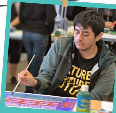
Waldo making an impression with colours