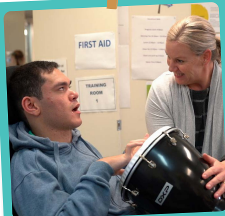
Ridge enjoying rhythms, beats and drums